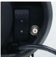
Spark proof design