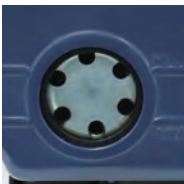
Anti-oil demister to prevent oil-mist