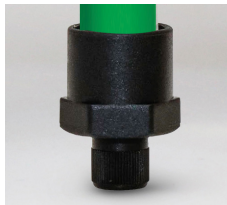
1/4" connections built in