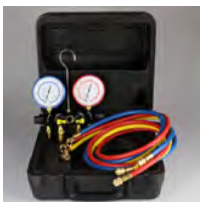
All in one box

Robust carry case with laser cut foam protection and manual.