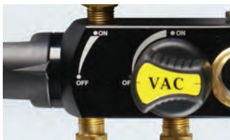
¼ turn control valves and sight glass